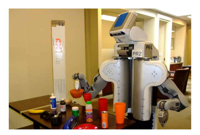
Fig. 2. The PR2 robot performing a grasping task on an object recognized from the model database.

For each object in the database, we used the Grasplt! simulator to compute a large number of grasp points for the PR2 gripper. We note that, in our current release, the definition of a good grasp is specific to this gripper, requiring both finger pads to be aligned with the surface of the object and further rewarding postures where the palm of the gripper is close to the object as well. Our grasp planning tool used a simulated annealing optimization, performed in simulation, to search for gripper poses relative to the object that satisfied this quality metric. For each object, this optimization was allowed to run over 4 hours, and all the grasps satisfying our requirements were saved in the database; an example of