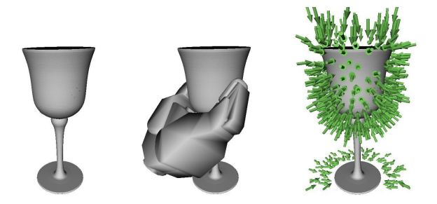
Fig. 1. Grasp planning in simulation on a database model. Left: the object model; Middle: grasp example using the PR2 gripper; Right: the complete set of pre-computed grasps for the PR2 gripper.

For each object, we acquired a 3D model of its surface (as a triangular mesh). To the best of our knowledge, no offthe-shelf tool exists that can be used to acquire such models for a large set of objects in a cost- and time-effective way. To perform the task, we used two different methods, each with its own advantages and limitations: